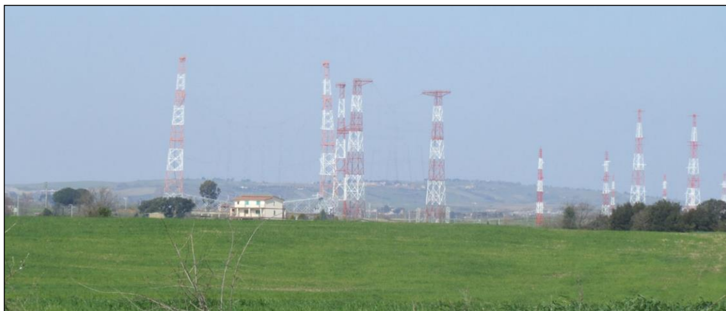
Santa Maria di Galeria