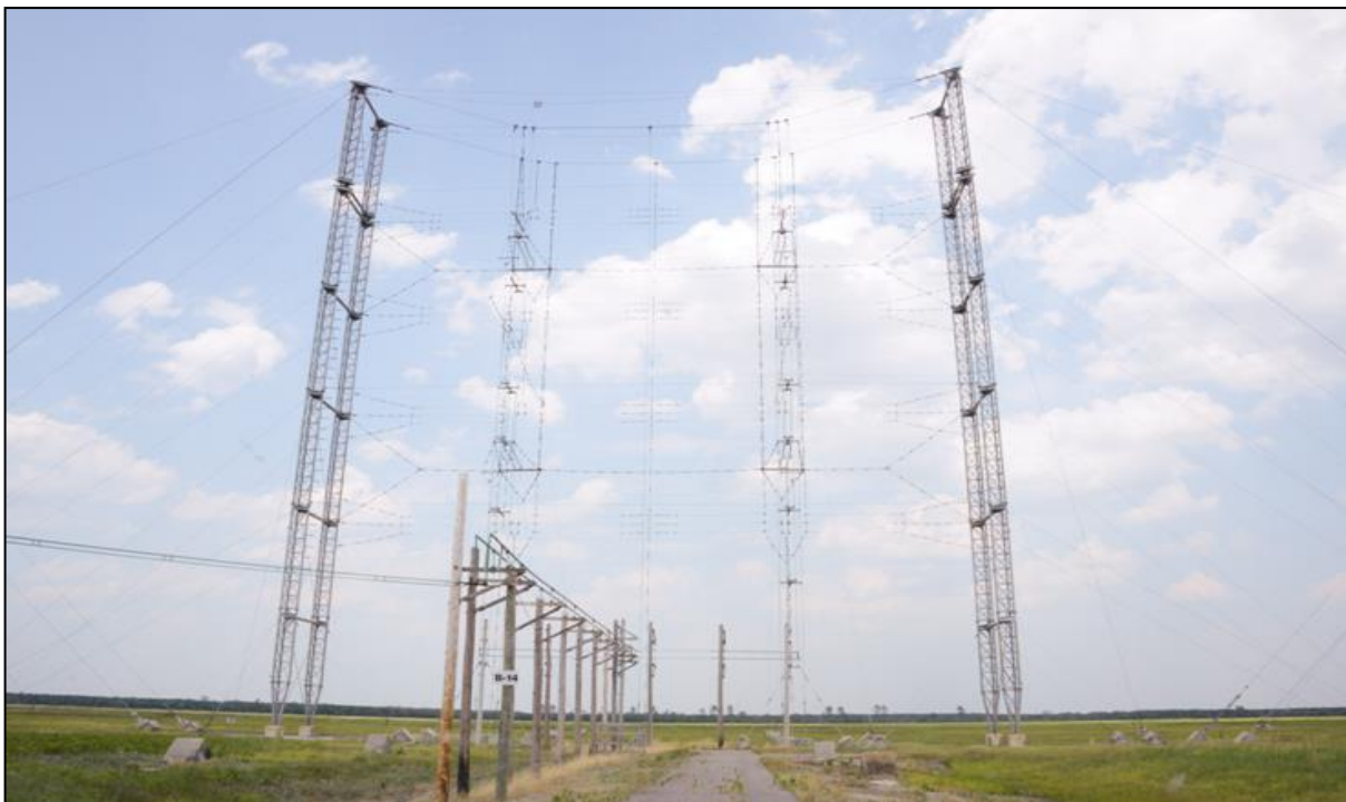
VOA Greenville site B